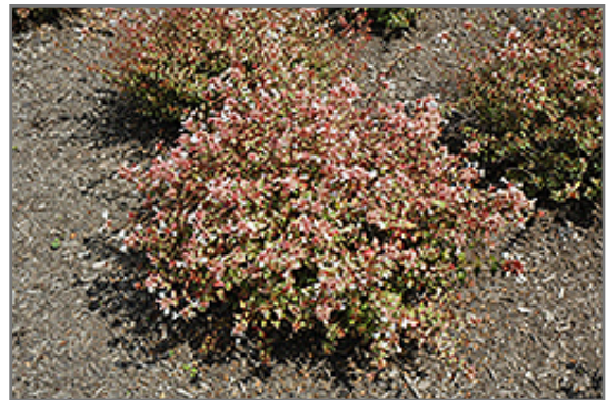
Sunshine Daydream Abelia in bloom