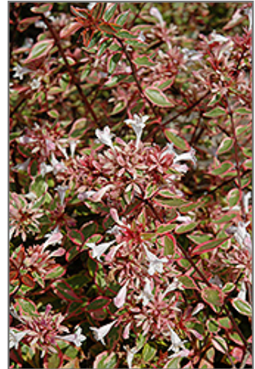
Sunshine Daydream Abelia flowers