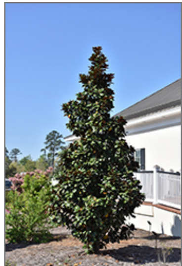
Teddy Bear Magnolia