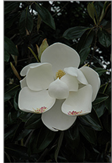
Teddy Bear Magnolia flowers