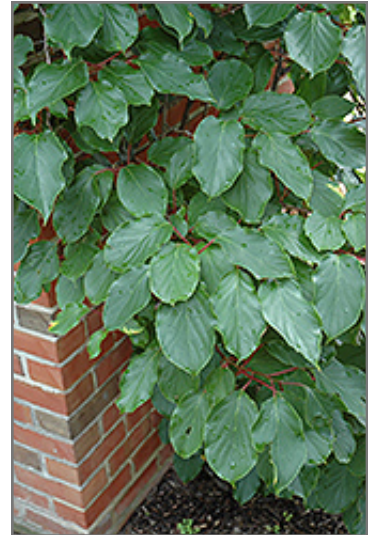
Weiki Hardy Kiwi foliage

Weiki Hardy Kiwi will grow to be about 40 feet tall at maturity, with a spread of 24 inches. As a climbing vine, it tends to be leggy near the base and should be underplanted with low-growing facer plants. It should be planted near a fence, trellis or other landscape structure where it can be trained to grow upwards on it, or allowed to trail off a retaining wall or slope. It grows at a fast rate, and under ideal conditions can be expected to live for approximately 15 years.