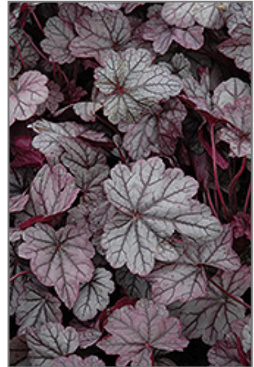
Carnival Sugar Plum Coral Bells foliage

Carnival Sugar Plum Coral Bells is recommended for the following landscape applications;