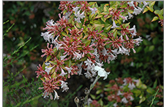
Francis Mason Abelia flowers