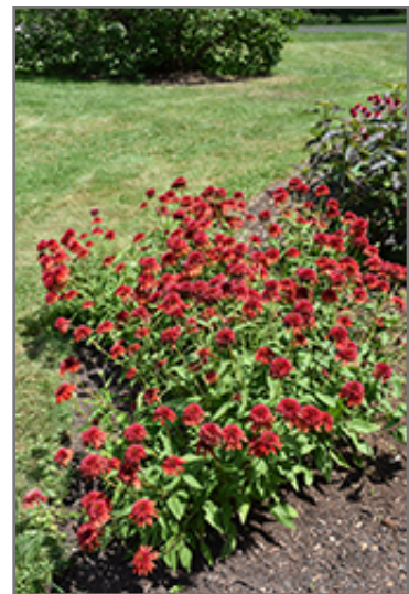
Double Scoop Orangeberry Coneflower in bloom