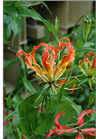
Gloriosa Lily flowers