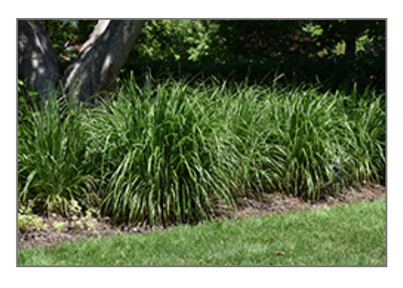
Korean Reed Grass