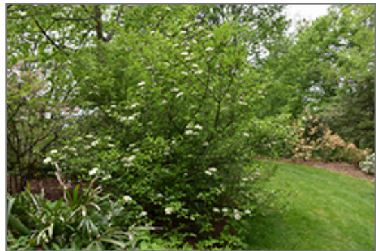
Emerald Charm Rusty Blackhaw in bloom