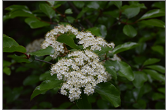
Emerald Charm Rusty Blackhaw flowers

Emerald Charm Rusty Blackhaw is recommended for the following landscape applications;