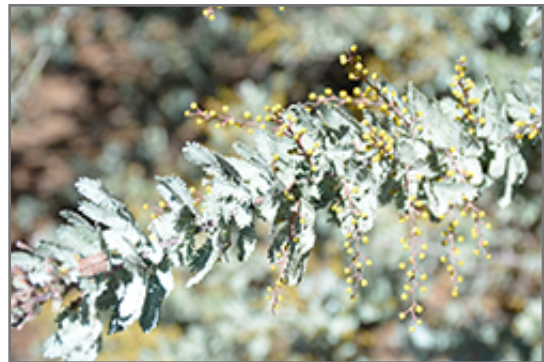
Cootamundra Wattle foliage