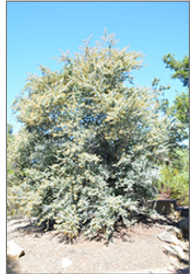
Cootamundra Wattle