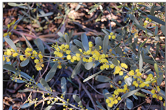
Low Boy Prostrate Acacia flowers