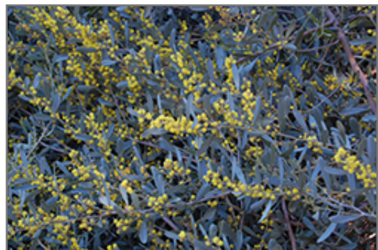
Low Boy Prostrate Acacia foliage