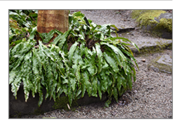
Hart's Tongue Fern

This variety is unusual in that it has simple, undivided fronds that are up to 2 feet long; yellowish and stunted in full sun; luxurious green foliage is a welcome addition to the garden as a groundcover