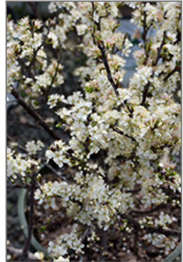
Beach Plum flowers