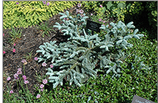
Prostrate Blue Noble Fir

Prostrate Blue Noble Fir will grow to be about 18 inches tall at maturity, with a spread of 6 feet. It tends to fill out right to the ground and therefore doesn't necessarily require facer plants in front. It grows at a slow rate, and under ideal conditions can be expected to live for 70 years or more.