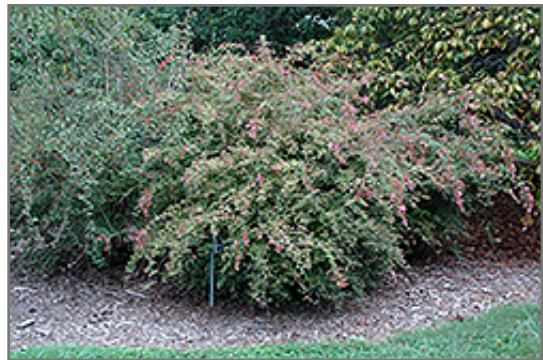
Edward Goucher Abelia in bloom