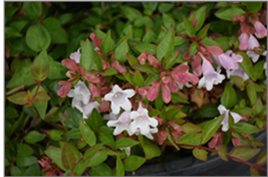
Edward Goucher Abelia flowers

Edward Goucher Abelia is recommended for the following landscape applications;