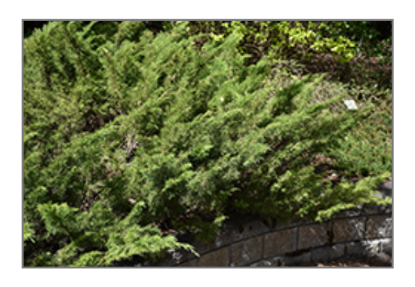
Skandia Juniper

Skandia Juniper is recommended for the following landscape applications;