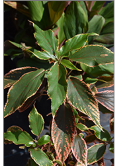
Bourbon Street Copper Plant foliage