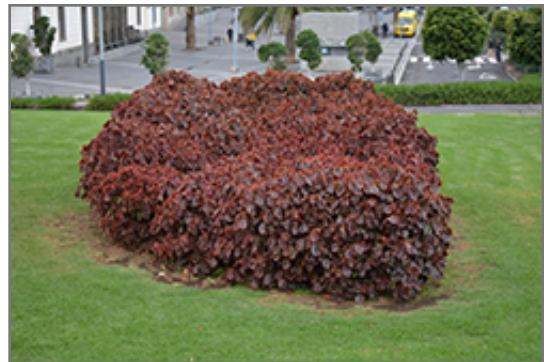
Obovata Copperleaf